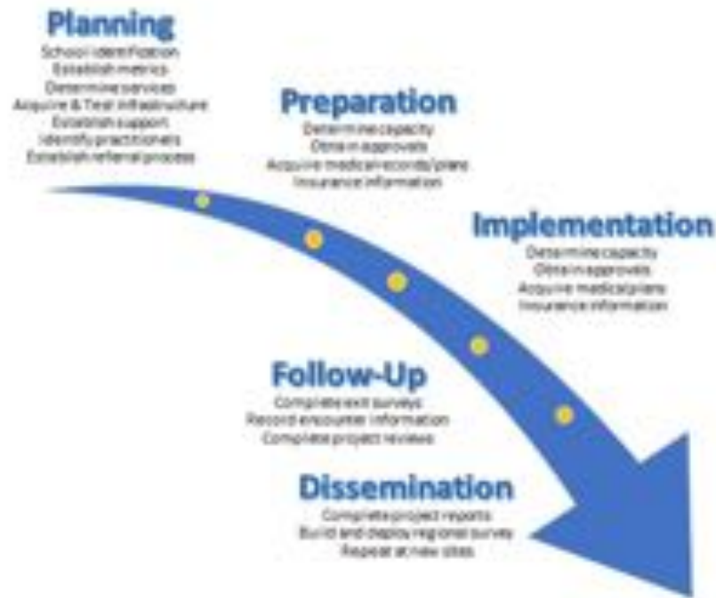
Telemental Project Phases